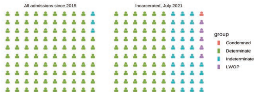
FIGURE 3: Comparison of all admissions since 2015 and the population of people currently incarcerated